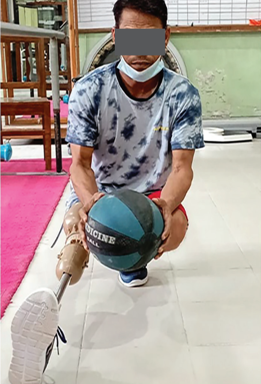
Figure 2 Pilate's exercise of amputee patients in different positions