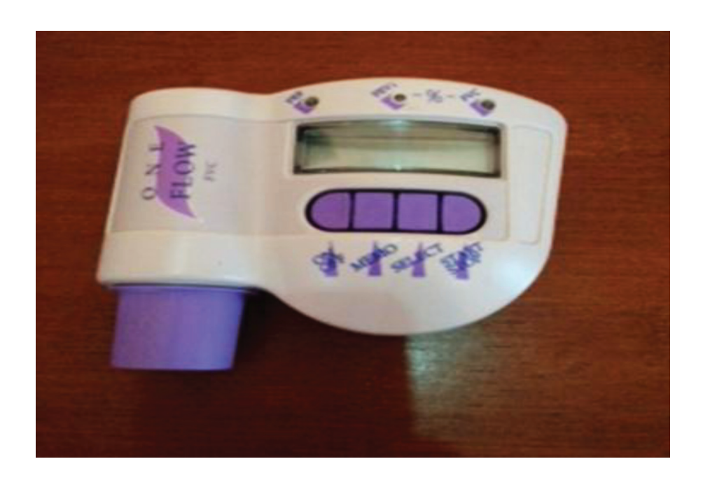
Figure 2 Spirometer One-Flow<sup>™</sup> Forced Vital Capacity Kit

After signing the consent form, each student stood straight, looking forward, with their chins slightly lifted. Standing tends to improve lung function and volume as well as improve the movement of the rib cage and respiratory muscles' function. All measurements were conducted under the same environmental factors, with the same temperature and humidity. This is provided by the spirometer guidelines; as per the recommendations of the American Thoracic Society/European Respiratory Society.<sup>15</sup> The spirometer encompassed four respiratory tests (PEF, FVC, FEV1,