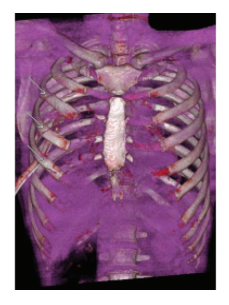
Figure 1 Initial plain radiography, and three-dimensional chest computerized tomography scan after chest tube insertion