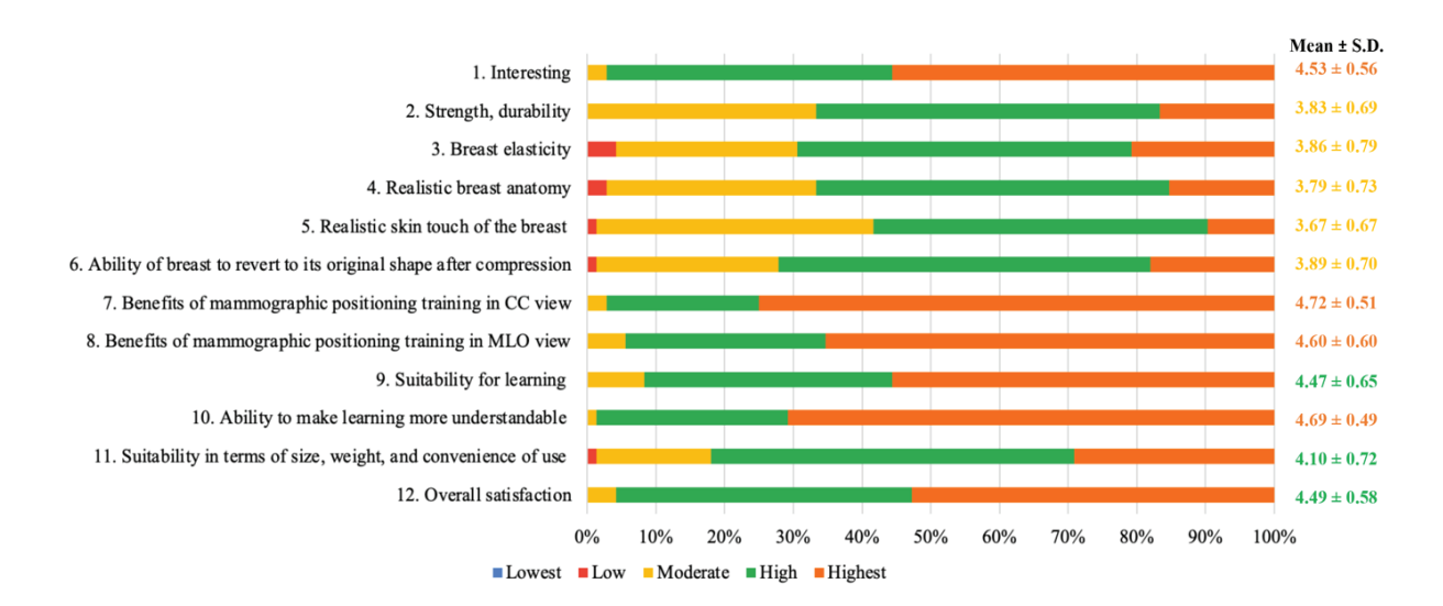
Figure 3 Rating of satisfaction by breast phantom users